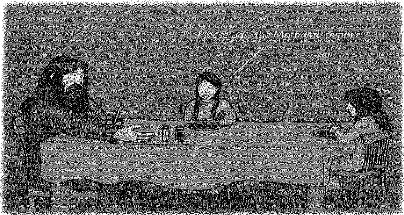
Lot and his daughters at the dinner table.

I don't think this is what Jesus was talking about when He said that we are to be the "salt of the earth!" While this is pretty funny, let's get serious for a couple of minutes. Salt was used a lot as a preservative back then because they did not have refrigeration. It was so precious that it was even used as money. The phrase "salt of the earth" means that one is upstanding, virtuous, worthy, honest. Jesus was talking to His disciples when He used this comment. In essence, He was saying that everyone is important—there are no people that are worth more than anyone else. The Bible says that God is not a respecter of persons—which means that God does not hold anyone in higher esteem than others. He created us equal—not matter our race or creed. We are the ones who have gotten this all backward in the last year. God help us to "get back to the basics" where we see that we are one body, serving One God, by the working of the Holy Spirit!!