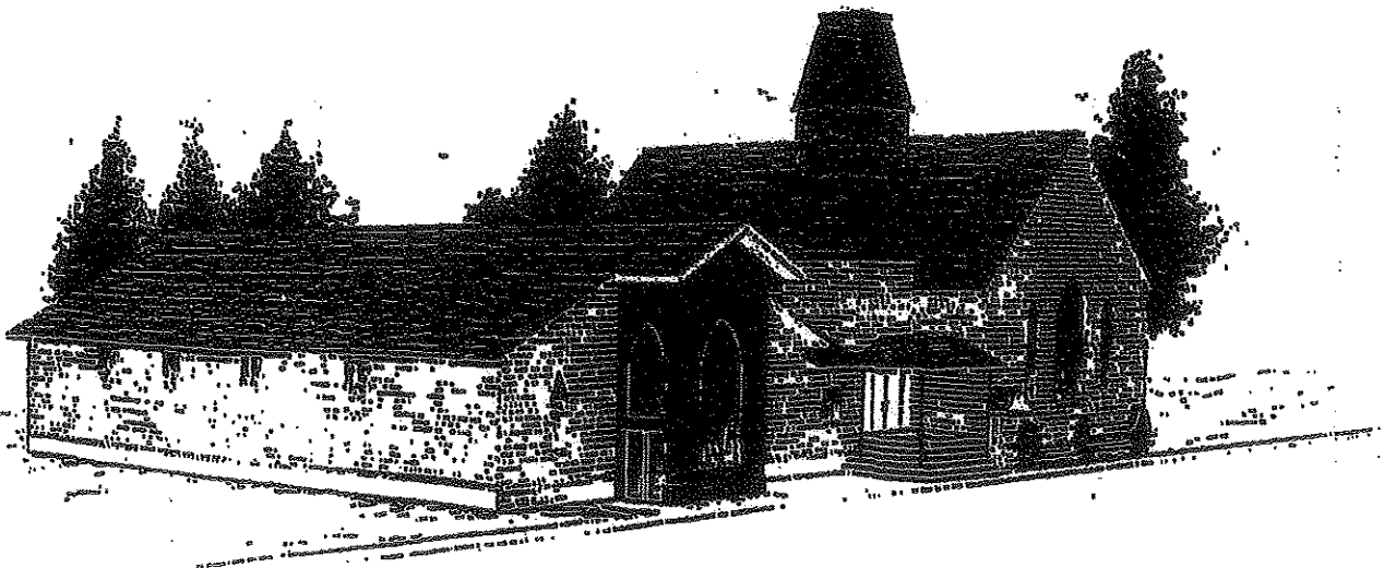
SEWARD CONGREGATIONAL CHURCH SEWARD, ILLINOIS